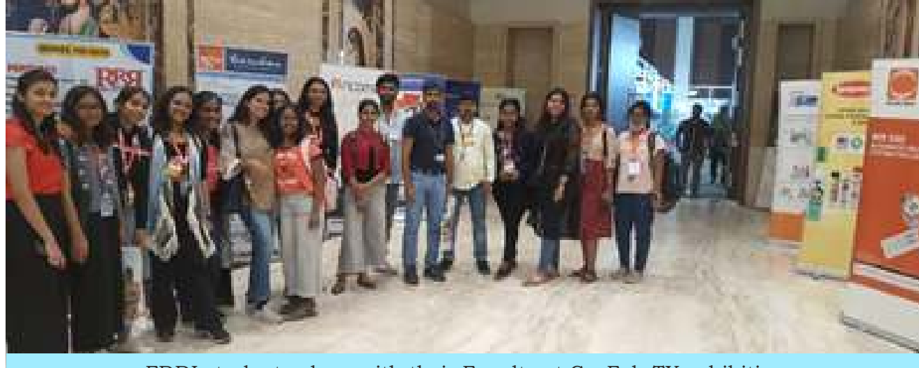
FDDI students along with their Faculty at GarFab-TX exhibition

The exhibition was a perfect place for the students to witness the intricate working of the machines and new technologies as the exhibition had on display & demonstration of combination of A.I (Artificial Intelligence) and design industry.