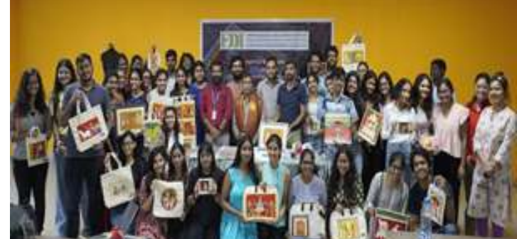
Participants who attended the 'Cheriyal' painting workshop

a narrative style. In the past, these paintings were common throughout Andhra and other regions of the nation, however they were each flavoured with their own distinctive styles and other regional quirks determined by regional customs and traditions. These paintings were popularly created for narration and storytelling purposes.