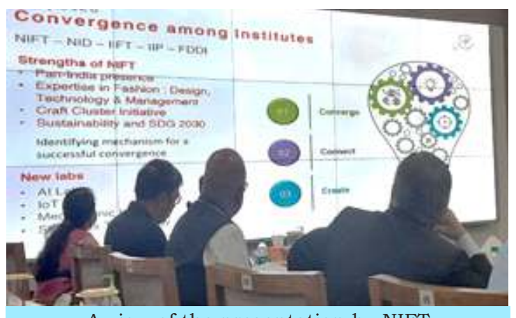
A view of the presentation by NIFT

resources and think about merging bodies to bring strength to them. He asked all the eminent institutions to increase its student intake by a minimum of 10X.