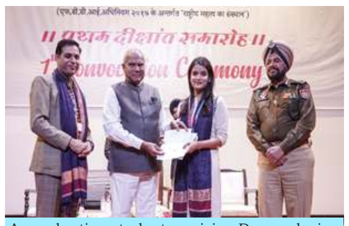
A graduating student receiving Degree during the Convocation ceremony

Footwear Design & Development Institute (FDDI), Chandigarh (Banur) campus held its 1st Convocation ceremony on 16th November 2022.