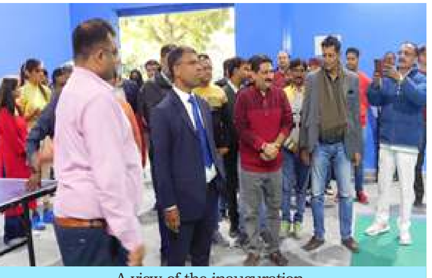
A view of the inauguration

Developing this s p o r t s infrastructure in the campus will help not only make a body physically fit and active, but also c o n t r i b u t e s towards the mental g r o w t h a n d development. With this facility now the