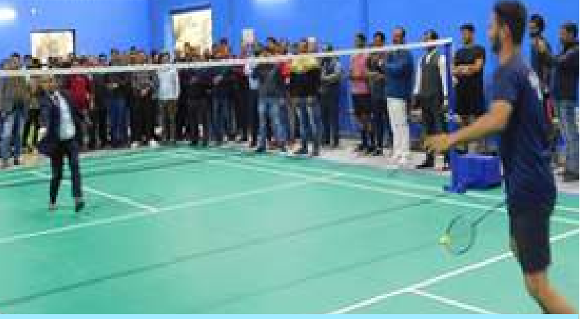
A view of friendly badminton match

students & staff will be able to enrich their minds with sportsman spirit.