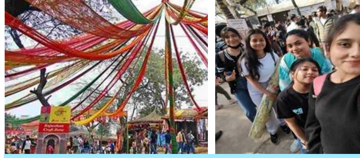
Students of FDDI, Rohtak campus visiting stall/ fair

The students of FDDI School of Fashion Design (SFD) and Foundation Batch, under the guidance of their faculty members visited the fair which showcases the richness and diversity of the handicrafts, handlooms and cultural heritage of India.