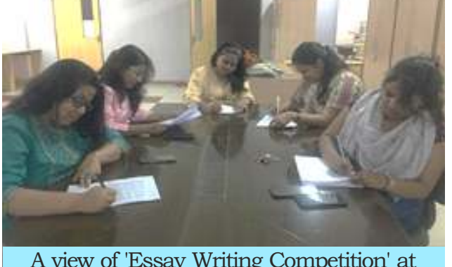
A view of IWD celebration at FDDI,