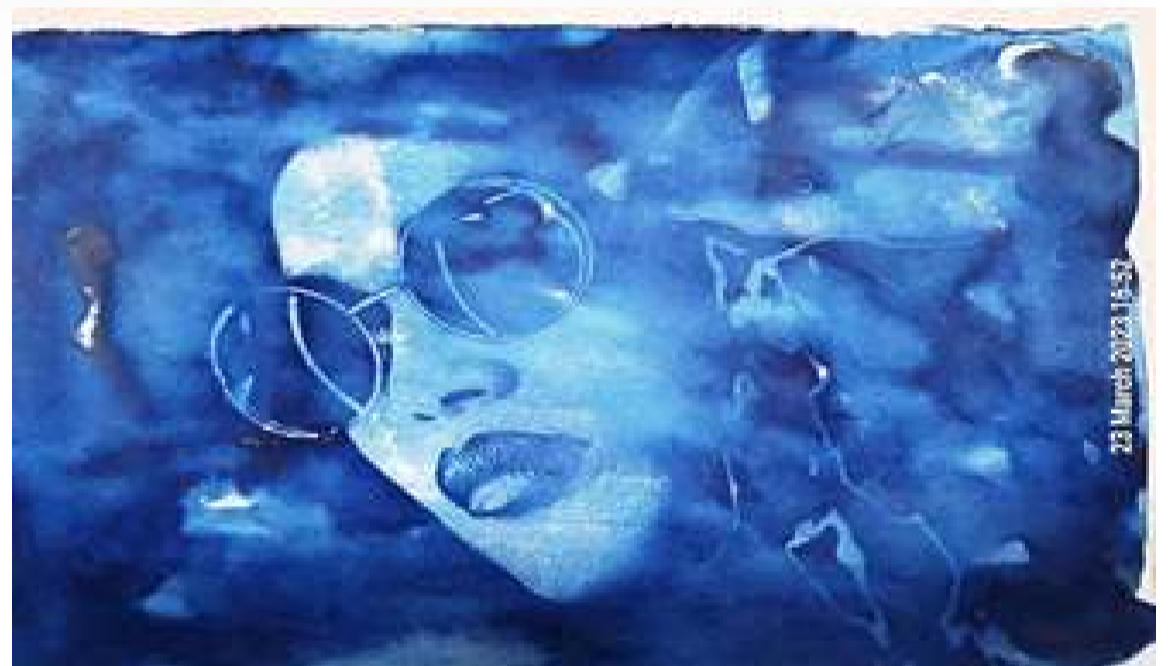
An outcome – creative expression

The participants were able to explore their creativity and experiment with different techniques and materials, such as stencils, textures and layering, to create their own unique prints.