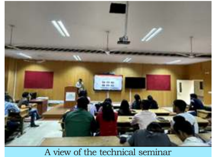
A view of the technical seminar

adhesive materials and bonding solutions used in footwear was attended by all student and faculty members from Footwear Design & Production and Fashion Design.