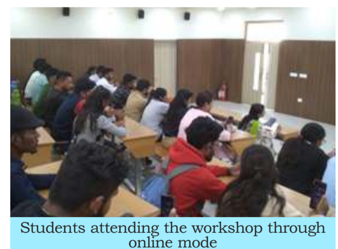
Students attending the workshop through online mode

The online workshop which was organized by the School of Retail and Fashion Merchandise (RFM) was attended by 60 students and staff members. There was also an open session during which the doubts of the students were cleared.