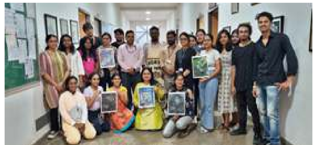
A view of the workshop

The workshop on 'Collography & Cyanotype' was conducted in two sessions. In the first session, the participants were provided with a variety of materials to create their own Collography plates, such as cardboard, glue, and textured paper. They were demonstrated by Mr. B. Ramesh on how to ink the plate and print it onto paper and fabric using a press. In the second session, the participants were provided with pre-coated paper or fabric and then dried the samples under dark light and then instructed on how to create a design or image using objects like leaves, flowers, and photo print OHP sheets.