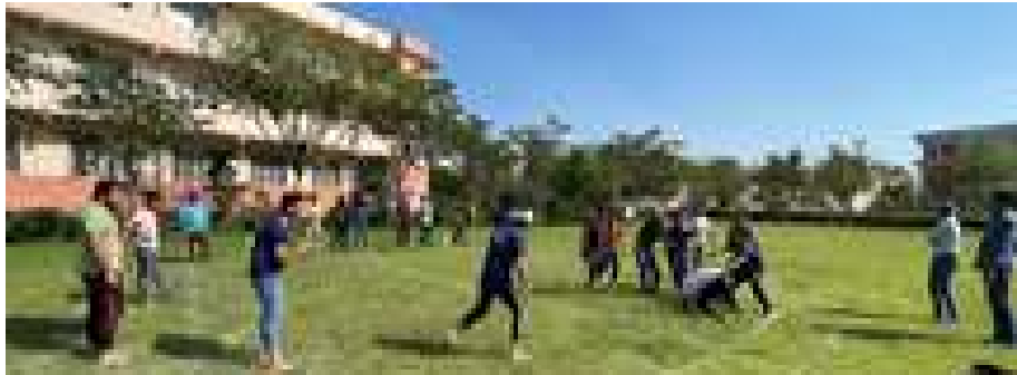
A view of 'Cultural & Sports' week at FDDI, Rohtak campus

Excitement and enthusiasm marked the Cultural event as various competitions were held for the students like Fire Free Cooking, Face Painting, Singing and Dance competition etc.