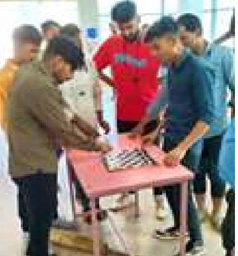
Student of FDDI, Guna campus participating in Chess competition

The week long programme provided a unique intellectual platform for the students to give expression to their interest and showcase their immense talents in non-academic fields.