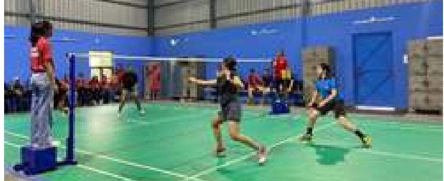
A view of 'Cultural & Sports' week at FDDI, Noida campus

The students across all the campuses of FDDI located at Noida, Fursatganj, Chennai, Kolkata, Rohtak, Chhindwara, Guna, Jodhpur, Ankleshwar, Banur, Patna and Hyderabad participated with great enthusiasm.