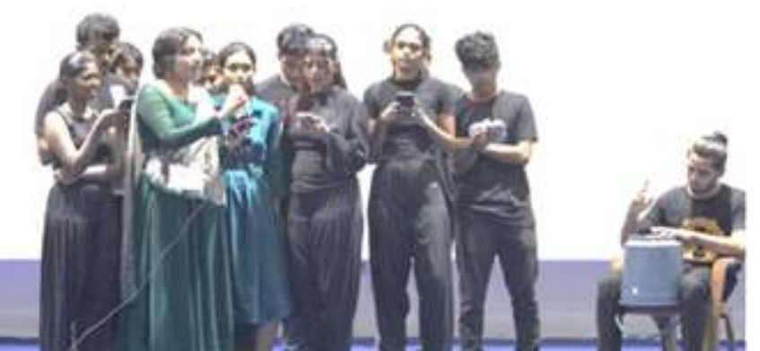
A view of 'Cultural & Sports' week at FDDI, Chennai campus

The 'Cultural & Sports' week brought out brilliant creativity & aptly revealed the hidden talents from the highly talented young participants.