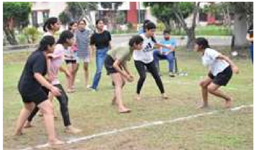
Student of FDDI, Kolkata campus participating in Kabaddi competition

The Sports events were held with great zeal, excitement and frolicsome atmosphere. A large number of students participated in games like Cricket, Futsal, Chess, Volleyball, Badminton, Table Tennis, Tug of War etc.