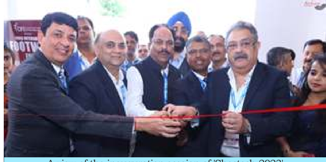
A view of the inauguration session of 'Shoetech-2023'

FDDI participated in 'Shoetech-2023' Fair which was organized by Indian Footwear Components Manufacturers Association (IFCOMA) on 4<sup>th</sup> & 5<sup>th</sup> of April 2023 at Hotel Madhu Resorts, Sikandra, Agra.