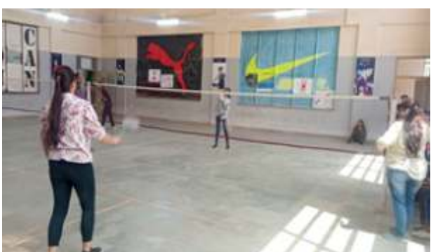
A view of 'Cultural & Sports' week at FDDI, Chhindwara campus