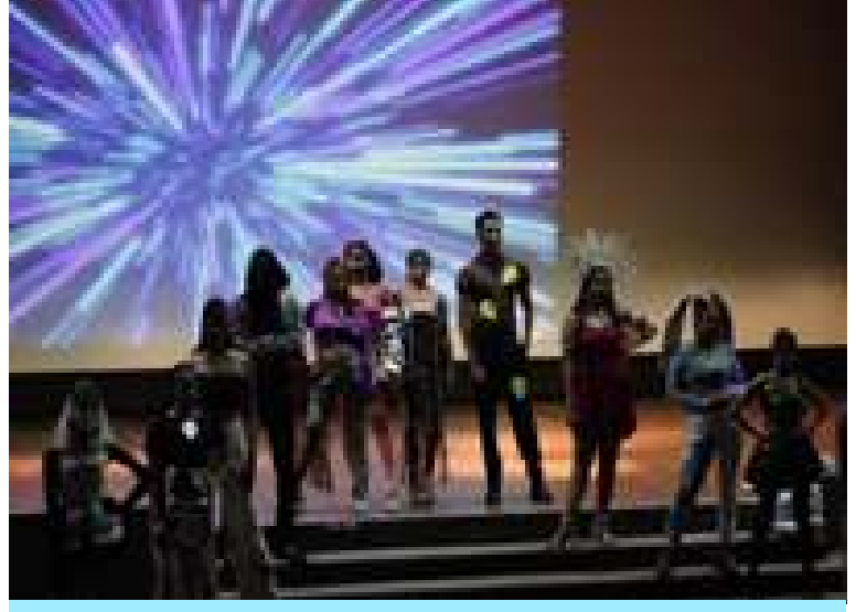
Cultural event at FDDI, Hyderabad campus