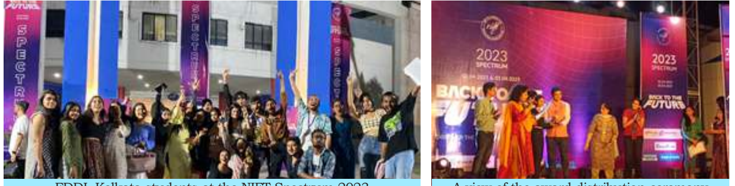
FDDI, Kolkata students at the NIFT Spectrum 2023

The two-day annual fest which was held on 2<sup>nd</sup> and 3<sup>rd</sup> of April 2023 at the NIFT campus located at Salt Lake City, Kolkata featured various competitive sports, extra-curricular and cultural events.