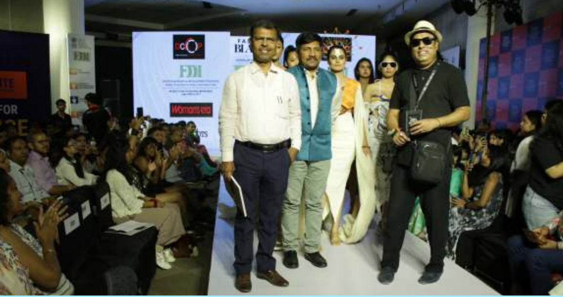
MD & Secretary FDDI alongwith the students on the ramp

The scintillating show was a big success and great opportunity for the 52 students of FDDI as they displayed creativity not only in designing the garments, but, versatility in organizing and also modeling for the show.