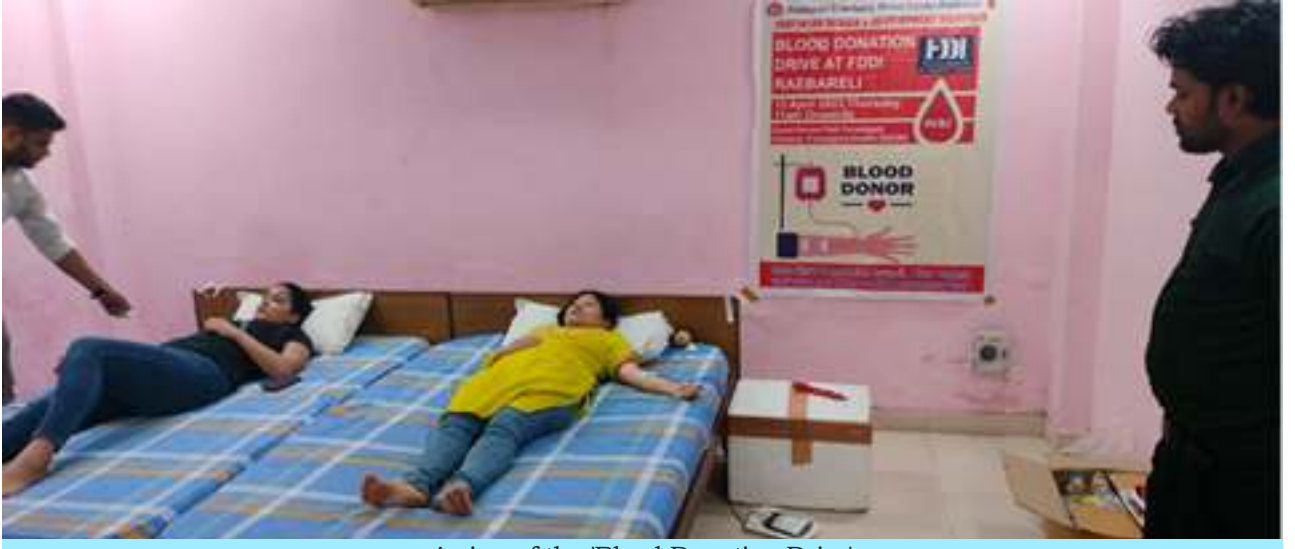
A view of the 'Blood Donation Drive'

Intended for the service of humanity, FDDI, Fursatganj organized a 'Blood Donation Drive' on 13<sup>th</sup> April 2023.