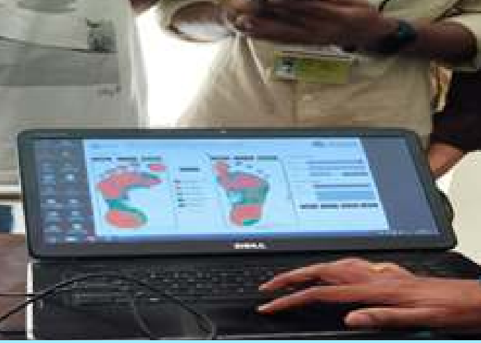
demonstrating the process of making customized shoes

He explained that proper fitting of shoes are a must which can be made after clinical examination. He further briefed about the relationship between foot type, foot deformity and effectiveness of footwear with orthosis for deformed foot.