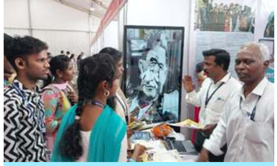
Employees of FDDI briefing to the aspiring students