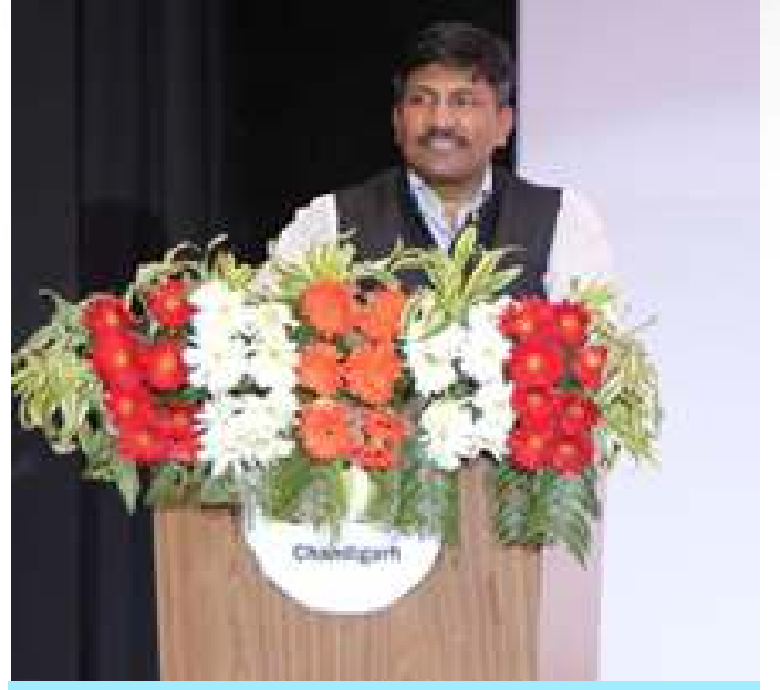
Secretary-FDDI delivering the 'Keynote Address'

A total of 23 collections, each made by a graduating student, were on display in front of the audience which included both conventional Indian clothing and modern Western clothing, all with a sustainable spin.