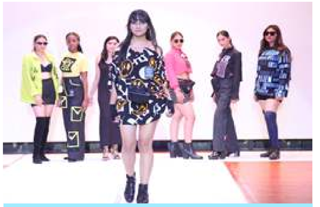
Students presenting their collection