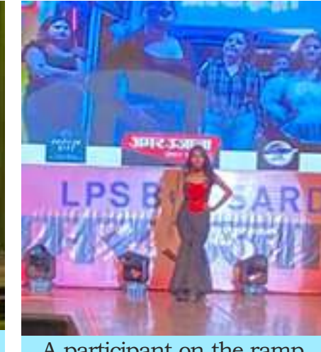
A participant on the ramp

The students of FDDI, who participated in the fashion show, displayed their fashion skills and walked gracefully on the ramp. The eye-catching collections of these students were appreciated by one and all present during the show and also received accolade from the entire media.