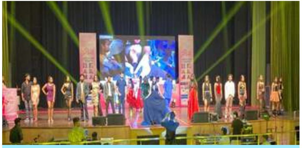
A view of the 'Perthma Haryana Queen' competition

The students of School of Fashion Design (FD) and School of Footwear Design & Production (FDP) displayed a range of fashion apparels/outfits and footwear on the ramp.