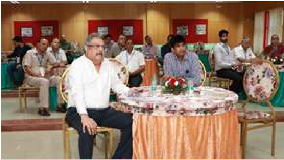
Delegates at the operationalization of CoE, Rohtak