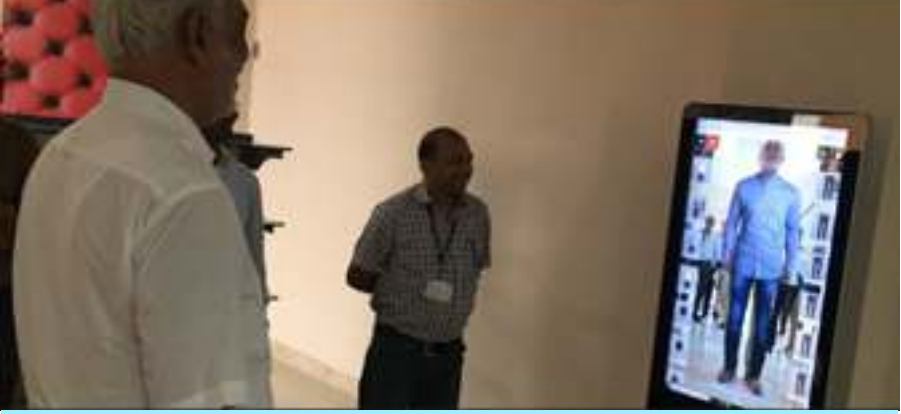
Delegate experiencing the augmented reality based magic mirror at CoE, Patna