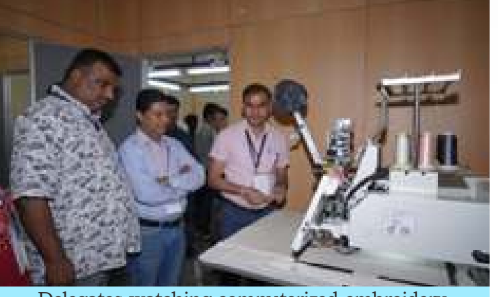
Delegates watching computerized embroidery machine set up at CoE, Hyderabad