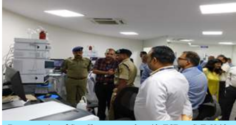
Demonstration of Gas Chromatography with ECD at CoE, Noida

The quality standards development and enforcement across the value shall be taken up on a much larger scale as the labs have been restructured with new advanced machines for improving testing and inspection in a transparent manner so that the Industry gets benefitted through the services of its International Testing Centre (ITC).