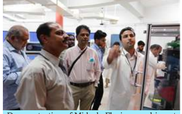
Demonstration of Midsole Flexing machine at CoE, Noida