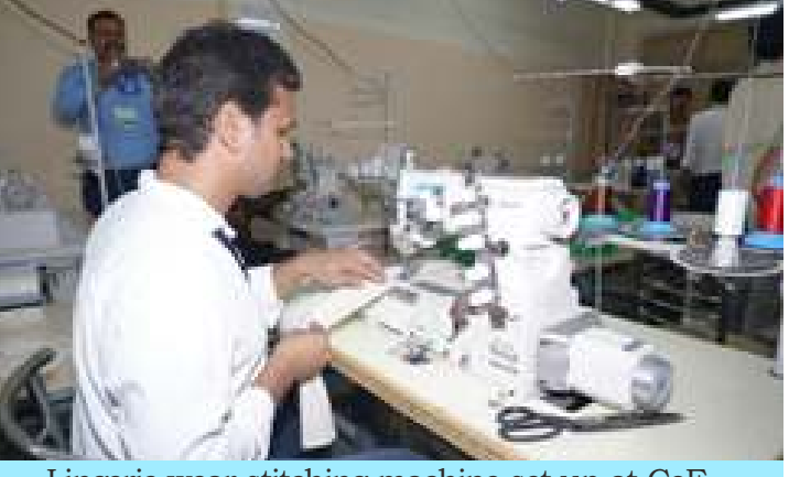
Lingerie wear stitching machine set up at CoE, Hyderabad

Apart from these, several other representatives from local/regional sectoral units consisting of doyens of the Industry were also present.