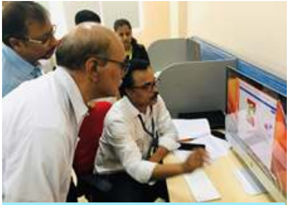
Faculty explaining the use of AI-based neuromarketing software at CoE, Patna to the delegates

At CoE, Patna, some of the distinguished guests were from Padwa Footwear, Raushnita Enterprises, Palak Enterprises, Rakesh Enterprises, Jeevika Rural Development Department, SJ International, NIFT-Patna, IIT-Patna, MIT-Muzaffarpur, Sketchers, V-Mart etc.