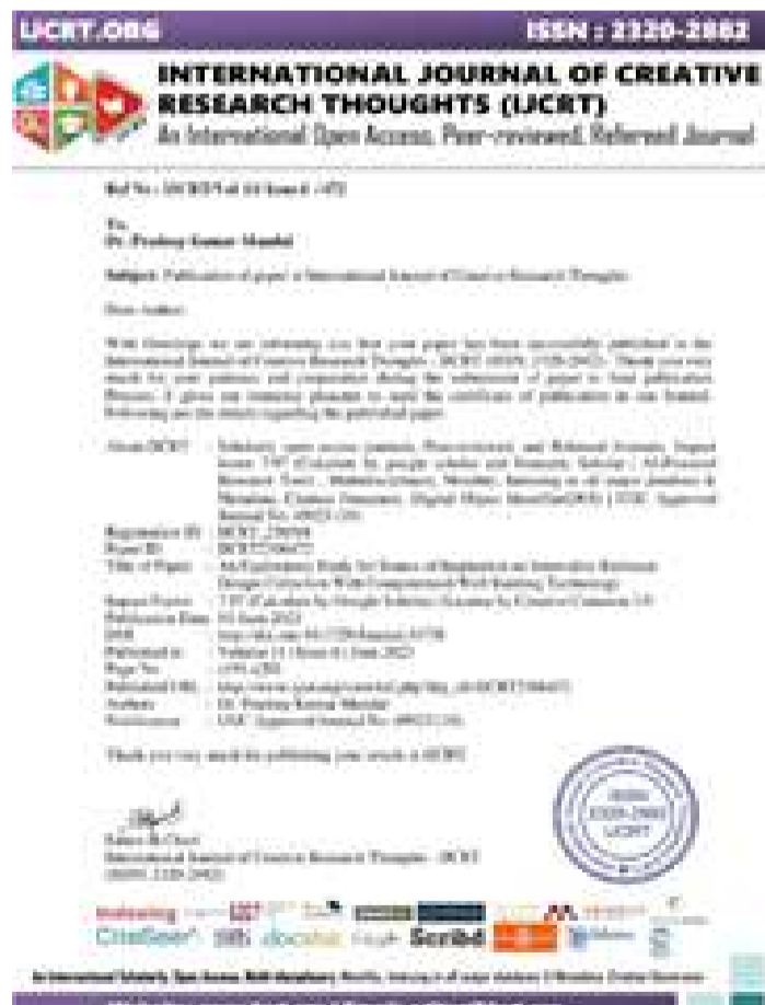
IJCRT, Confirmation Letter