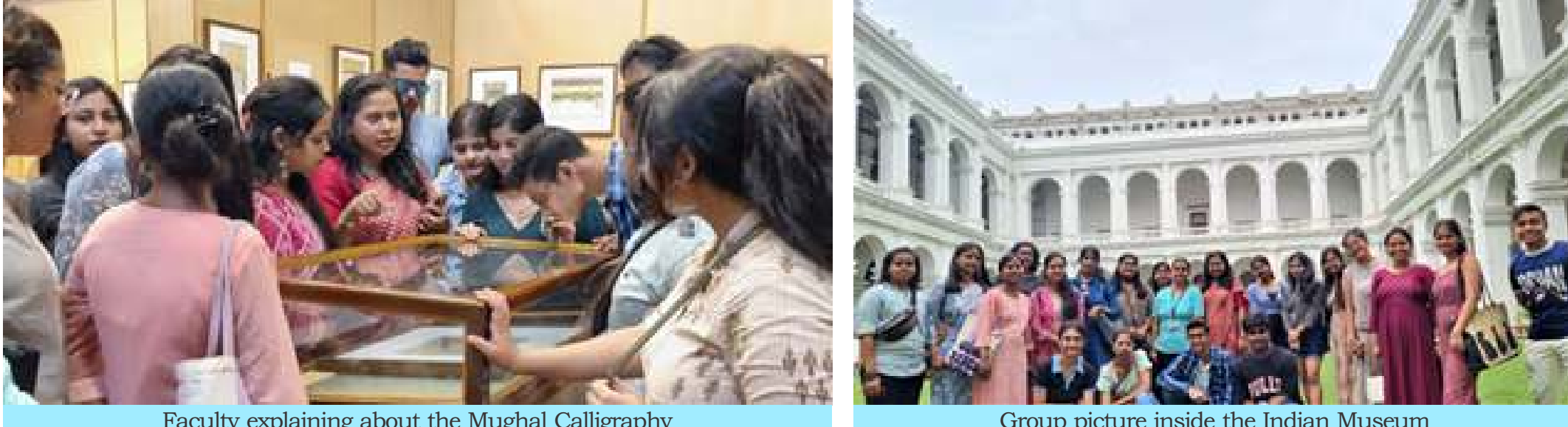
Faculty explaining about the Mughal Calligraphy