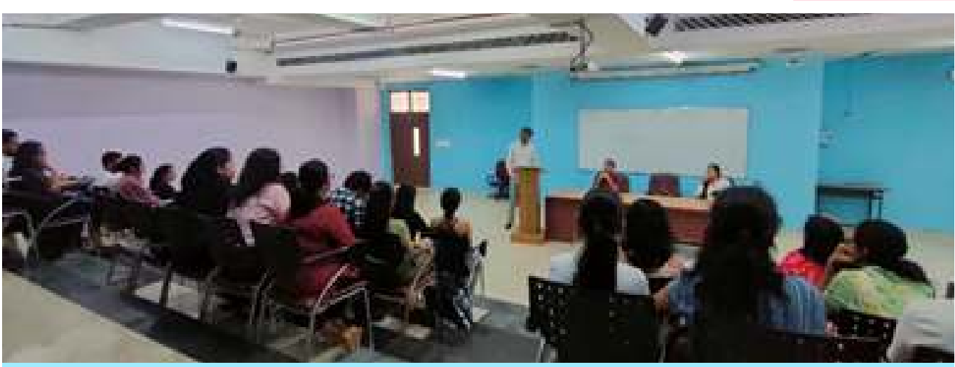
A view of the industry interaction