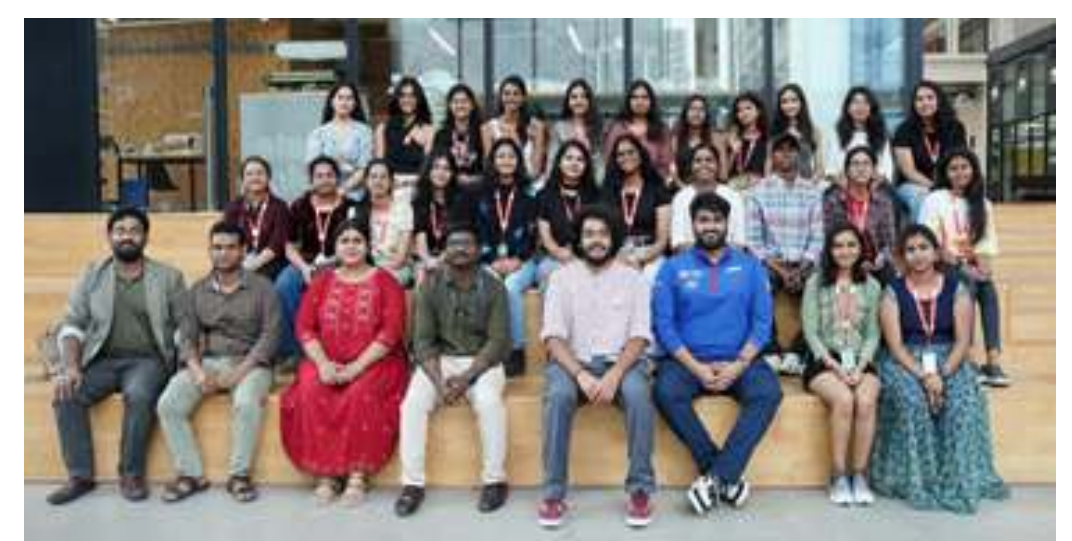
Students and Faculty members with team of T-Works

On 12<sup>th</sup> September 2023, under the 'Educational Trip', the students of FDDI Hyderabad campus visited T-Works. The objective of the visit was to provide an opportunity to the budding designers of School of Fashion Design (SFP), to explore the intersection of fashion and technology.