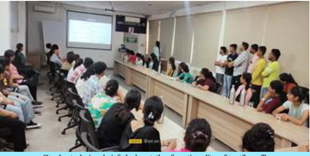
Students being briefed about the functionality of textile mill

Under the supervision of the highly experienced faculty of FDDI, the students of FDDI learned about how yarn is manufactured practically by different machines, dyeing process, laboratory testing, carding, drawing, fabric processing (Scouring, mending, rapier loom) packing, warehousing etc.