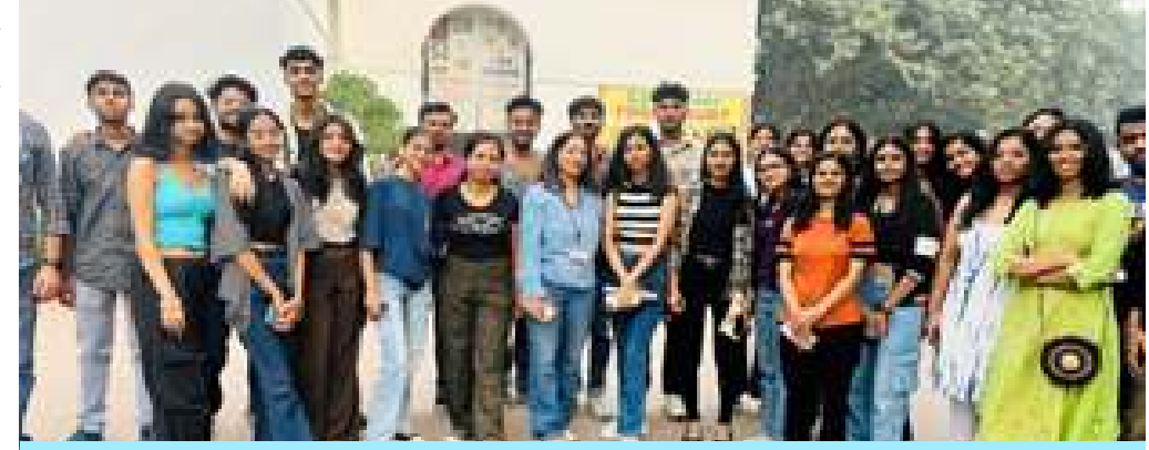
FDDI students along with their Designing Faculty at National Museum, New Delhi

The Museum presently holds approximately 2,00,000 objects of diverse nature, both Indian as well as foreign, and its holdings cover a time span of more than five thousand years of Indian cultural heritage.