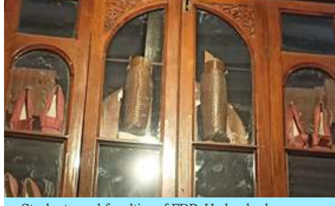
Students and faculties of FDP, Hyderabad campus witnessed 18<sup>th</sup> and 19<sup>th</sup> century footwear

In addition to the impressive wardrobe, the students were treated to a fascinating display of 18<sup>th</sup> and 19<sup>th</sup>-century footwear that had once been worn by the Nizam of Hyderabad. These well-preserved and intricately designed shoes and boots served as a tangible link to the opulent lifestyle and history of the Nizam dynasty.