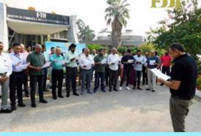
'Integrity Pledge' taken by FDDI staff at Noida campus

The theme chosen for this year's 'Vigilance Awareness Week' was "Say no to corruption; commit to Nation". FDDI conducted series of events to highlight the importance of integrity, transparency and accountability.