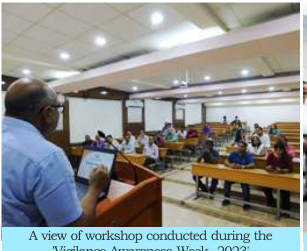
'Vigilance Awareness Week -2023

Under the directions of the Central Vigilance Commission, 'Vigilance Awareness Week -2023' was observed at all the campuses of FDDI located at Noida, Fursatganj, Chennai, Kolkata, Rohtak, Chhindwara, Guna, Jodhpur, Ankleshwar, Banur, Patna and Hyderabad from 30.10.2023 to 05.11.2023.