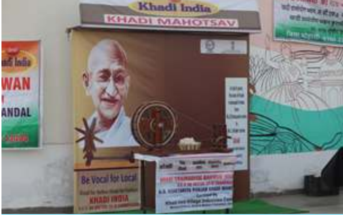
A view of the exhibition of 'Khadi & Creative Products'

Visitors to the exhibition were captivated by the diverse range of Khadi