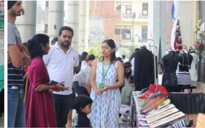
Visitors at the exhibition

products on display. The enthusiasm was not limited to customers alone; officials from nearby departments also visited the stall with keen interest, gaining insights into the intricate craftsmanship and the sustainable practices behind creative and Khadi products.