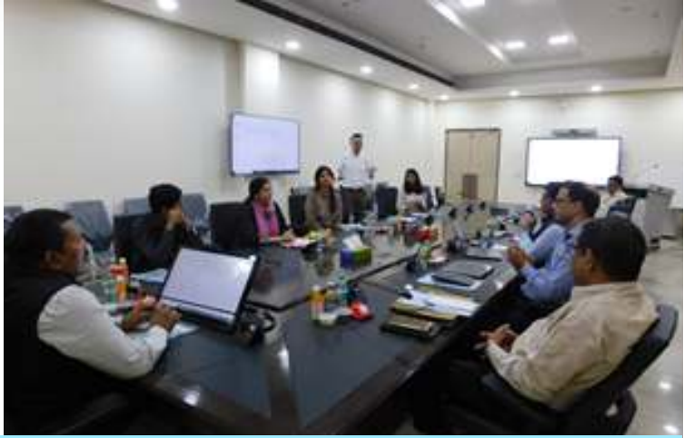
'Immersion Program' in progress