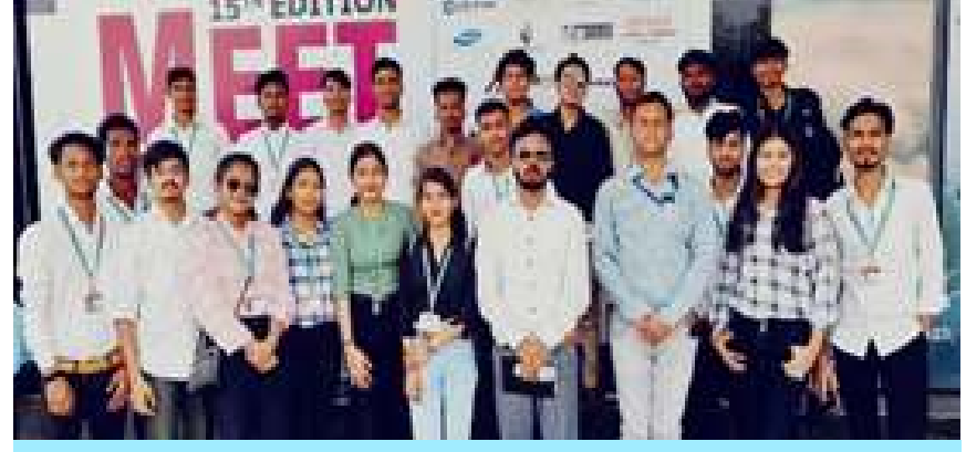
Students of FDDI, Chhindwara campus visiting 'Meet at Agra 2023'

The students of School of Footwear Design & Production (FDP) of FDDI, Chhindwara campus underwent a week long industrial tour of Agra Footwear Cluster, which provided a unique opportunity for 25 students of third/fifth semesters to gain first hand insights into the operations of prominent industries in the Agra region, particularly focusing on the footwear and related sectors.