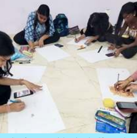
Students participating in Slogan & Poster making competition