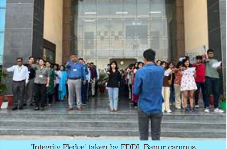
'Integrity Pledge' taken by FDDI, Banur campus

The theme chosen for this year's 'Vigilance Awareness Week' was "Say no to corruption; commit to Nation". FDDI conducted series of events to highlight the importance of integrity, transparency and accountability.