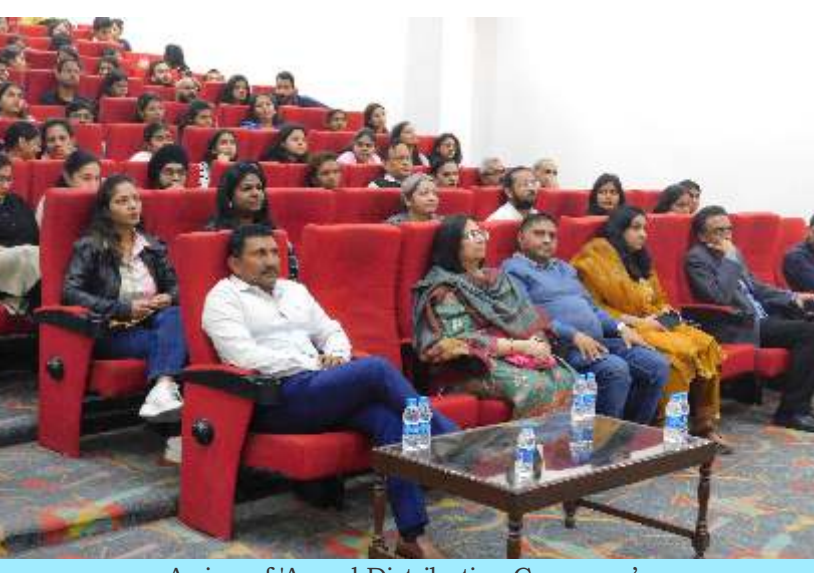
A view of 'Award Distribution Ceremony'