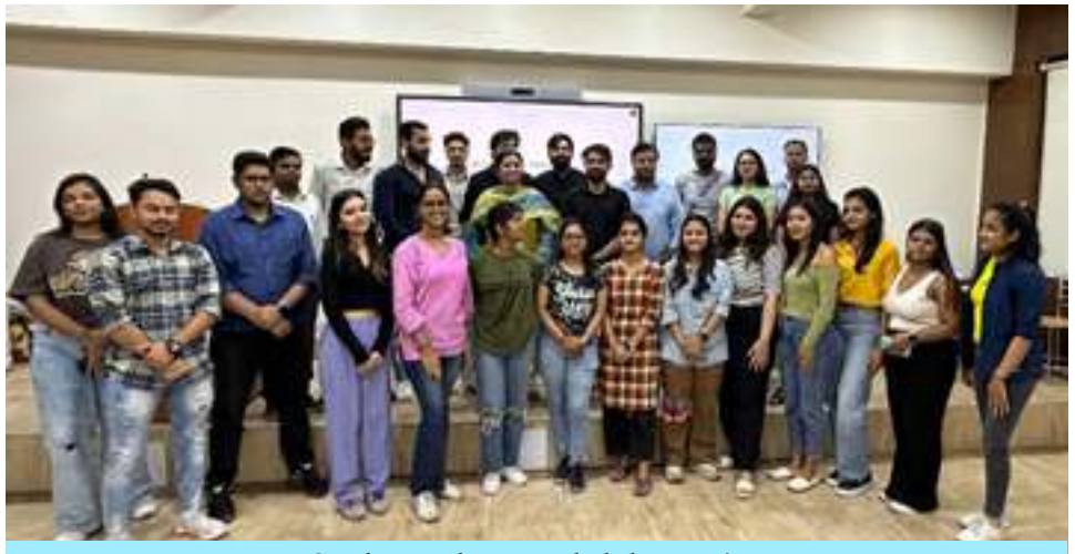
Students who attended the session

Through a wealth of practical tips and tricks, Mr. Ranjan equipped attendees with the essential tools needed to excel in the competitive landscape of e-commerce, inspiring them towards future success.