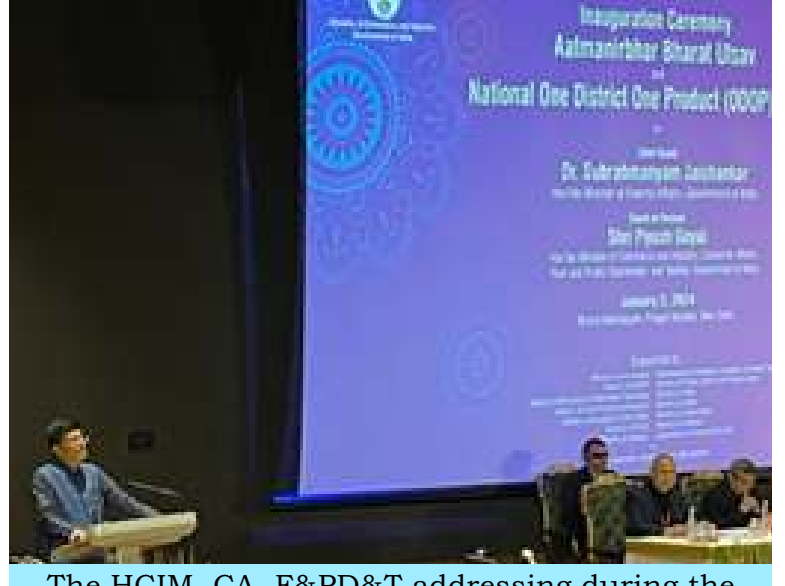
The HCIM, CA, F&PD&T addressing during the inaugural session of 'Aatmanirbhar Bharat Utsav'

During the inauguration, the HCIM, CA, F&PD&T emphasized the government's commitment to a better future for the 140 crore Indians under the leadership of Hon'ble Prime Minister of India, Mr. Narendra Modi.