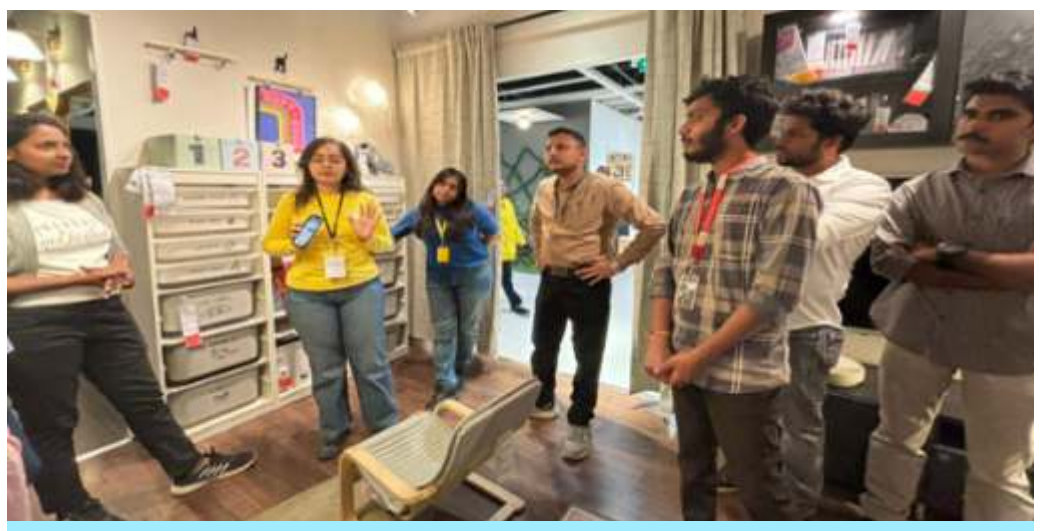
Students interacting with experts of IKEA

During the visit on 23<sup>rd</sup> February 2024, the students interacted with Interior Designing, Visual Merchandising & Marketing experts, where they gave insight knowledge about their area. The students had an enriching experience of visiting a marketplace inundated with innovative ideas and a transparent marketing strategy to build a delightful shopping experience.