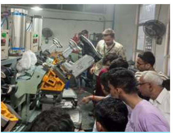
Students being briefed by experts of Mallcom India Ltd.