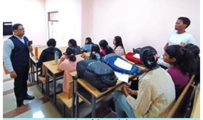
A view of the workshop