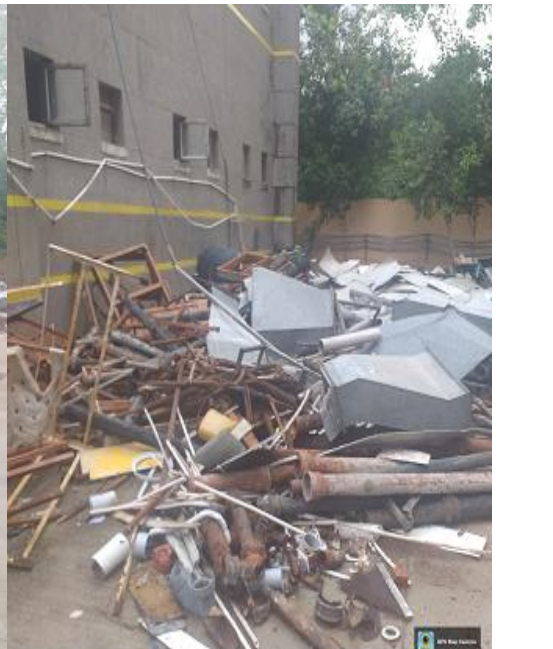
Noida, Uttar Pradesh, India Glitz Hostel-3, FOOTWEAR DESIGN AND DEVELOPMENT INSTITUTE, Block B, Sector 23, Noida, Uttar Pradesh 201301, India Lat 28.590277° Long 77.351102° 15/09/22 12:49 PM