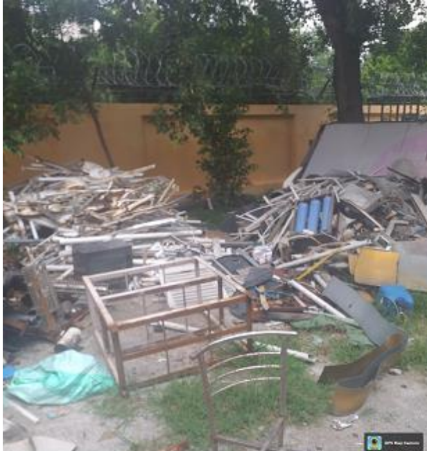
Noida, Uttar Pradesh, India A-10/A FDDI Marg Noida-201301 NCR, Block B, Sector 23, Noida, Uttar Pradesh 201301, India Lat 28.592259° Long 77.350027° 15/09/22 12:37 PM