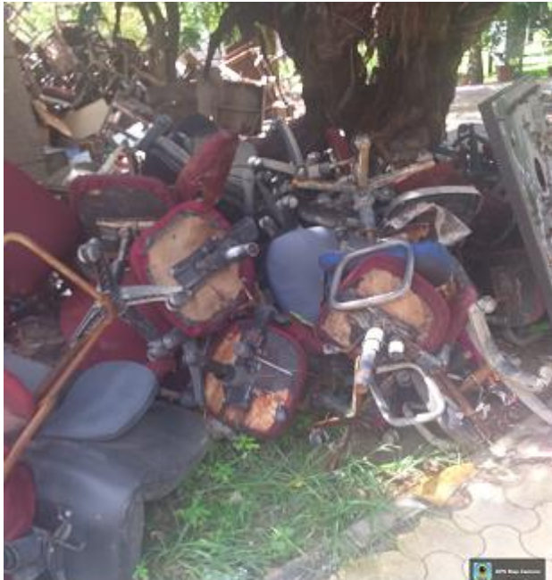
Noida, Uttar Pradesh, India CANTEEN, FOOTWEAR DESIGN AND DEVELOPMENT INSTITUTE, Block B, Sector 23, Noida, Uttar Pradesh 201301, India Lat 28.590888° Long 77.350731° 15/09/22 12:48 PM