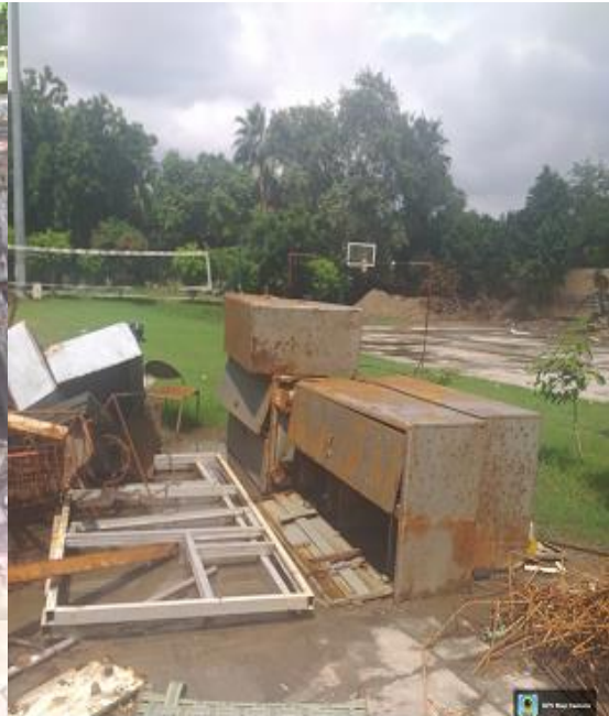
Noida, Uttar Pradesh, India CANTEEN, FOOTWEAR DESIGN AND DEVELOPMENT INSTITUTE, Block B, Sector 23, Noida, Uttar Pradesh 201301, India Lat 28.590862° Long 77.350771° 15/09/22 12:48 PM