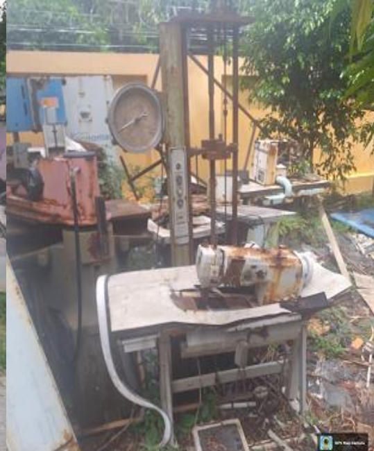
Noida, Uttar Pradesh, India A-10/A FDDI Marg Noida-201301 NCR, Block B, Sector 23, Noida, Uttar Pradesh 201301, India Lat 28.592317° Long 77.35009° 15/09/22 12:37 PM