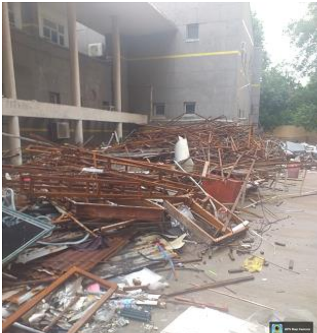
Noida, Uttar Pradesh, India NCR India, A-10/A, Block B, Sector 24, Noida, Uttar Pradesh 201301, India Lat 28.590221° Long 77.350986° 15/09/22 12:48 PM